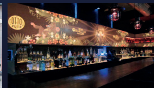
Otto Zutz Restaurant, 2012, Spain