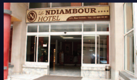
Le Ndiambour Hotel, 2018, Dakar - Senegal