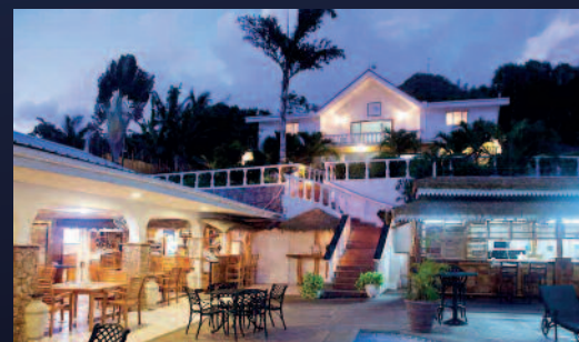
Le relax Luxury Lodge, Seychelles