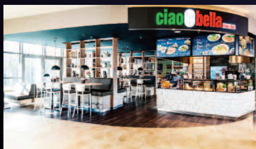
Ciao Bella, 2017, Ulm - Germany