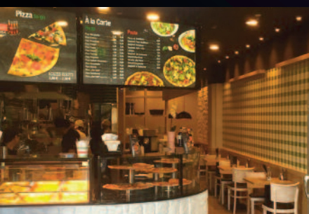
Ciao Bella, 2016, Mainz - Germany