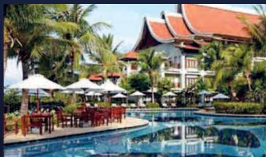
Lankawi Westin Resort, 2010, Malaysia