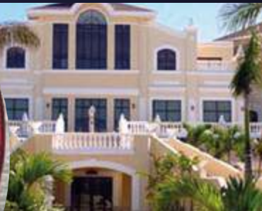
Mangon Hotel, 2008 - Cuba