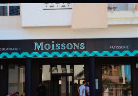
Boulangerie Les Moissons , 2017, Morocco