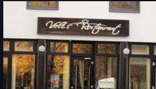
Velis Restaurant, 2014, Berlin - Germany