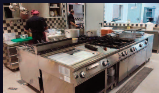
Pizzeria Ristorante Aducci, 2017, Italy