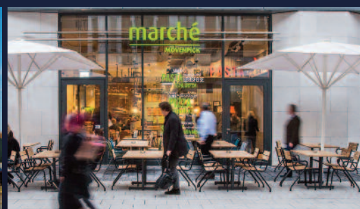
Marché Mövenpick, 2017, Bielefeld - Germany