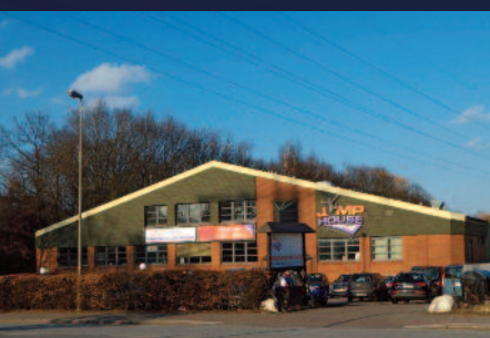
Jump House, 2017, Hamburg - Germany