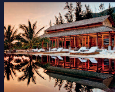
An Lam Hotel, 2011, Vietnam