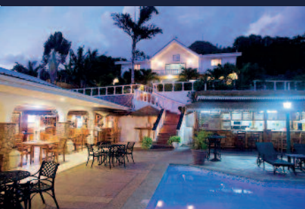
Le relax Luxury Lodge, Seychelles