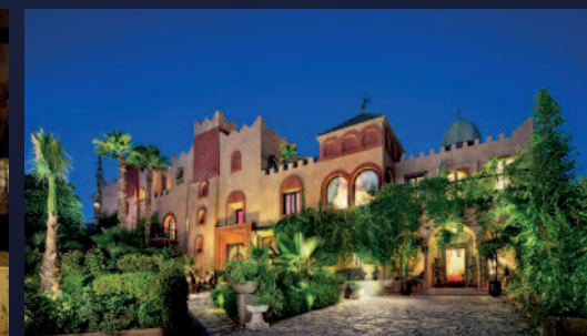
Hotel Kasbah Tamadot, 2012, Ansi - Morocco