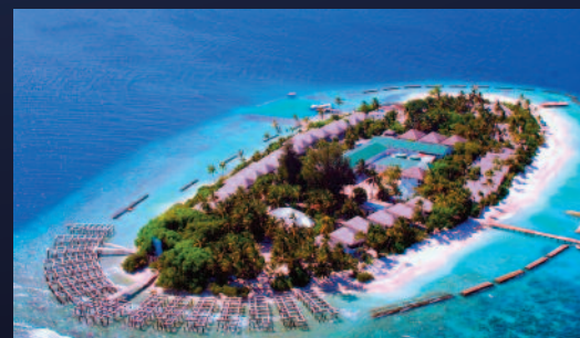
Kuda Rah Island Resort, 2015, Maldives