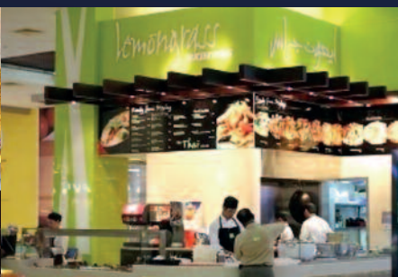
Lemongrass, 2011, Dubai - UAE