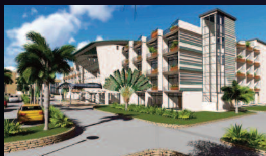
Kivu Marina Bay Hotel, 2018, Rwanda