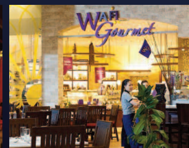
Wafi Gourmet, 2016, Bahrain