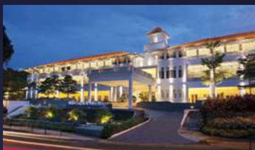
Moevenpick Heritage, 2010 - Singapur