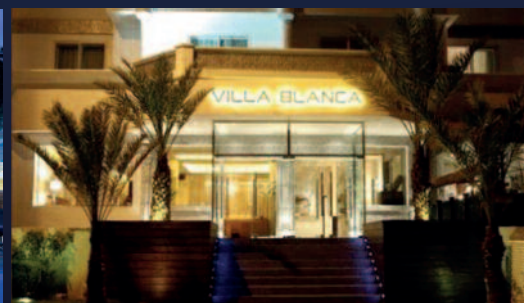
Villa Blanca, 2011, Casablanca - Morocco