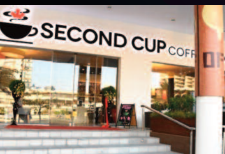
Second Cup Cafe, 2016, Bahrain