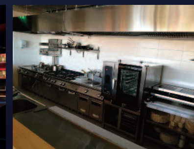
Restaurant Nobu, 2017, Montenegro