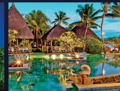
Hotel Mahe La Pirogue, 2010, Seychelles