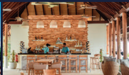
Fushifaru Hotel Resort, 2016, Maldives