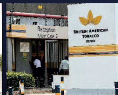
British American Tobacco, Canteen, Kenya