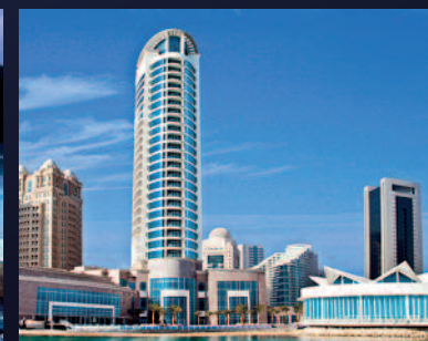
Doha Hilton, 2010, Qatar