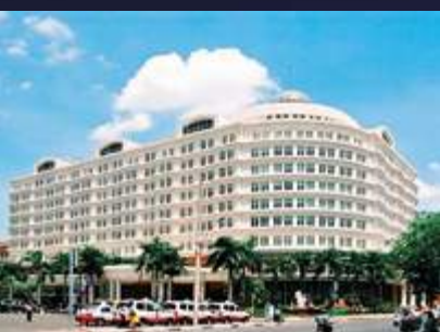
Park Hyatt, 2013, Saigon - Vietnam