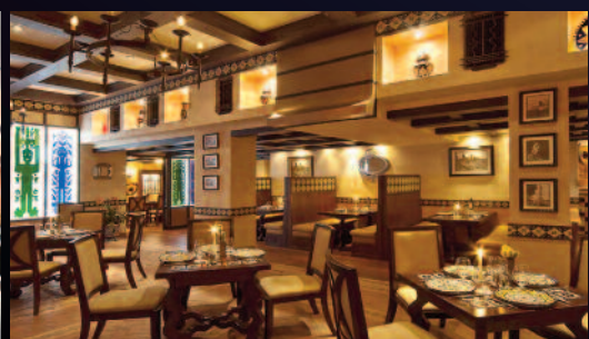
Margherita Restaurant, 2016, Bahrain