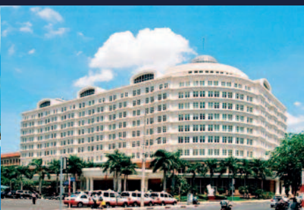
Saigon Park Hyatt, 2013, China